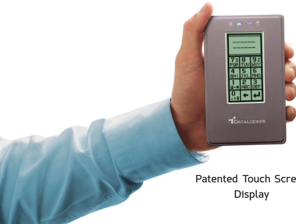
Patented Touch Screen Display